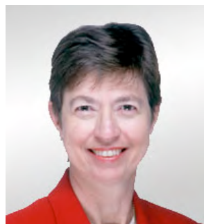
Dr. Marye Anne Fox Chancellor, University of California, San Diego