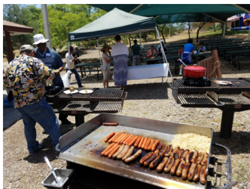
Preparing to feed the crowd