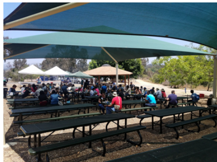
Eating and socializing