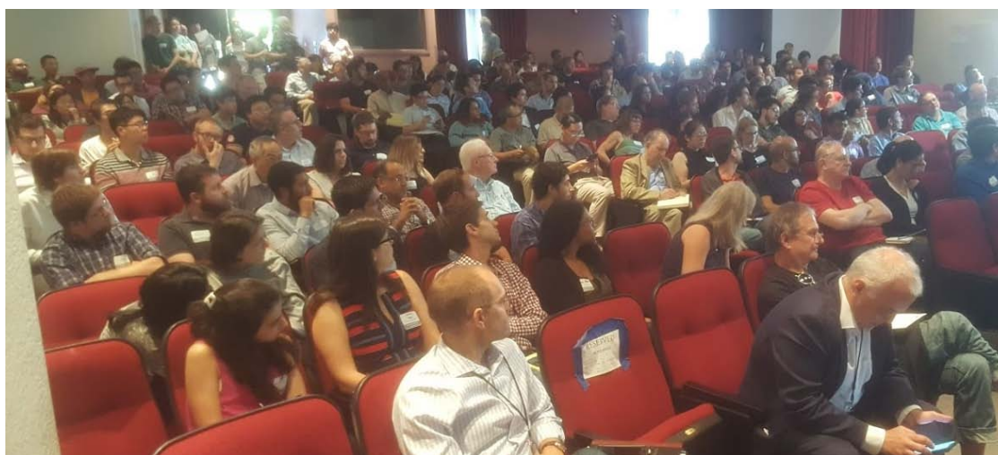
A packed auditorium for the entire day