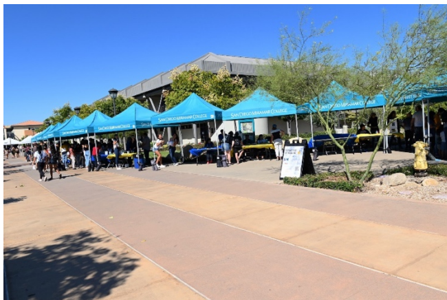
Miramar Hand On Demo tables

Miramar college organized a series of hands-on demo tables. Science professors kept the tables staffed with close to 100 volunteers throughout the day.