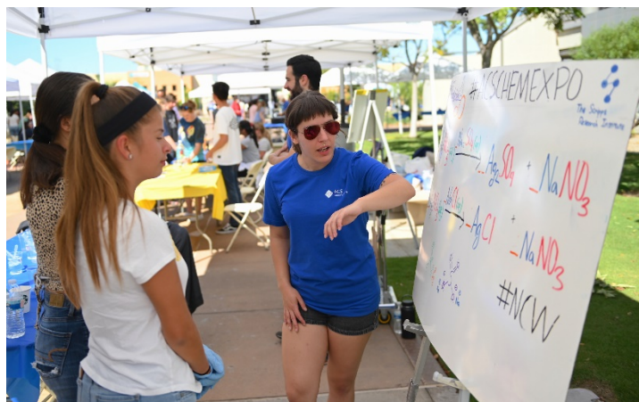
The Scripps Research Institute, Engel Lab post docs, show metals and chemistry reactions.