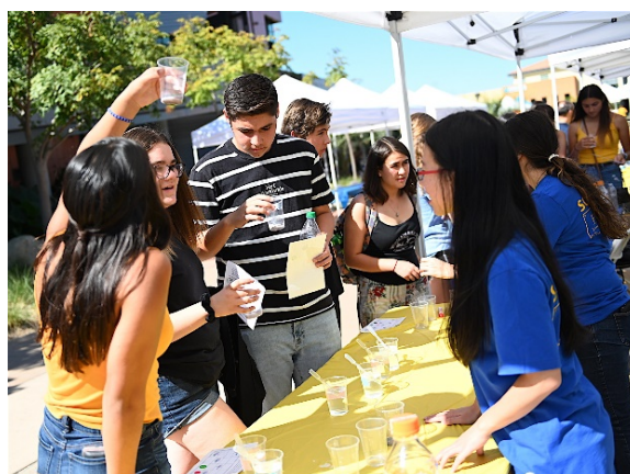
American Women In Science (AWIS) had a table demonstration

SWIGS volunteers, ran the Smells Exhibit. Plastic jars with holes in the lids were loaded cinnamon sticks, lemons, and coffee beans, etc. to help visitors learned to associate certain classes of odors to chemical structures.